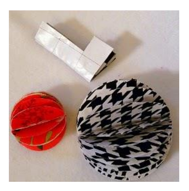
3.) Start gluing your halves together. You'll eventually have a big stack of your shape folded in half and glued together.