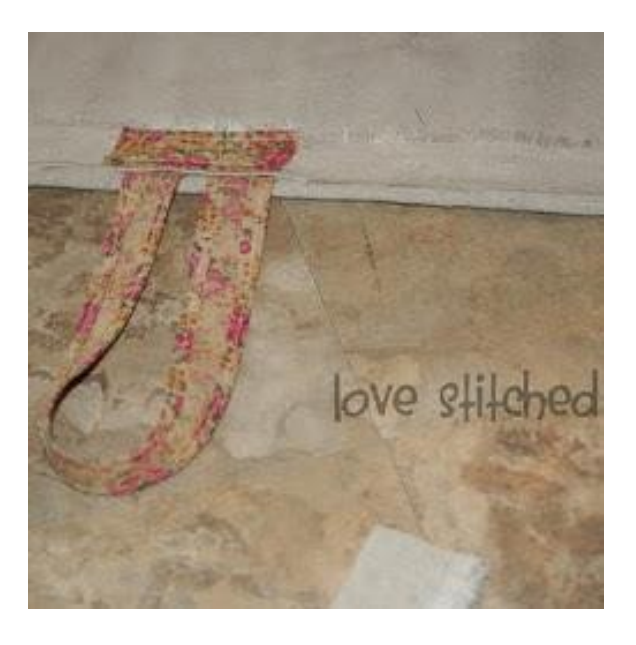
10.) I attached a cute piece of fabric to hang it up with but you could just as easily use ribbon or some other decorate touch!

9.) Lastly I folded the top and bottom inch over and glued it down leaving an opening to slide a metal or wood dowel to keep it straight and weigh it down!