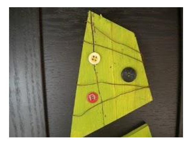
7.) I used a little wooden rectangle that I picked up at Hobby Lobby for the trunk.