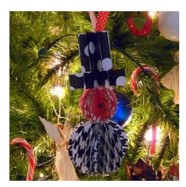
5.) Then glue your shape(s) together and hang on your tree.